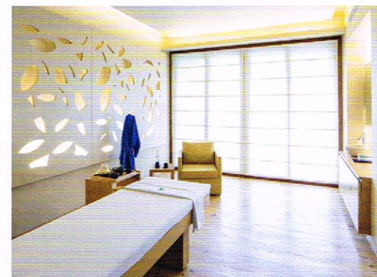
Above: one of the treatment rooms at Vana Malsi Estate, Uttarakhand, India