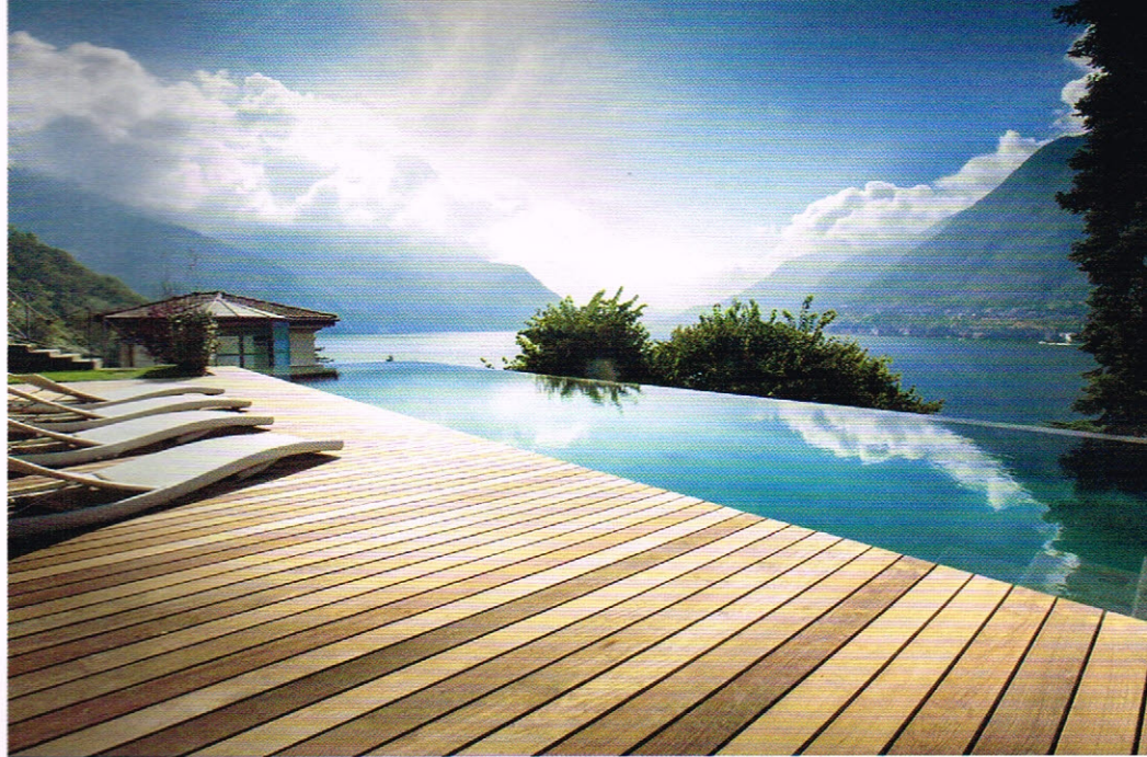
Above: the 20m infinity pool at Villa Lario, Lake Como, Italy. Below: a private terrace at Azzaytouna villa in Marrakech's Palmeraie district

✈ Last September saw the Goodwood Revival roll through the Earl of March's WEST SUSSEX