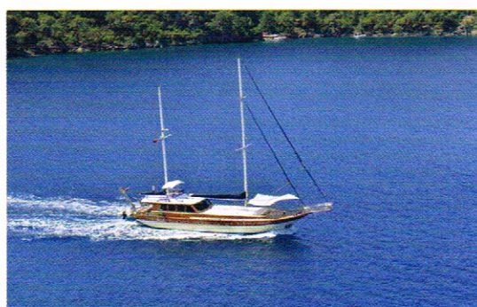
Above: Euphoria , based off Turkey's Datça peninsula, can be hired through Red Savannah