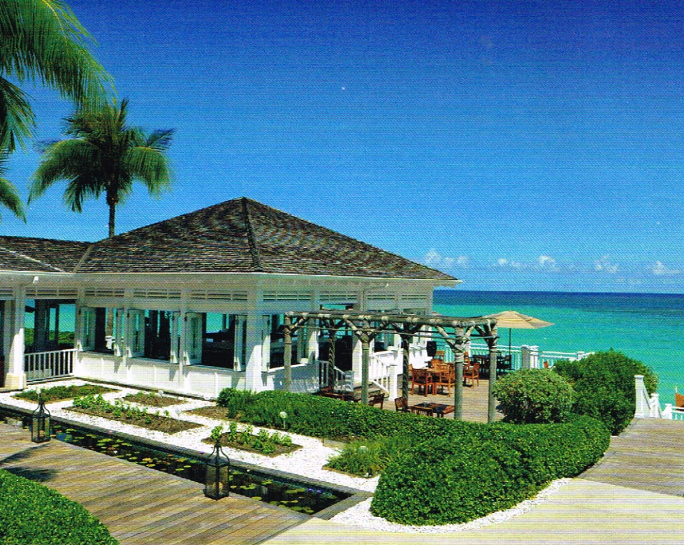
Above: the terrace of Dune restaurant at One&Only Ocean Club, Bahamas. Below: Lake Starnberg, one of the stops on Butterfield & Robinson's Bavarian cycle tour